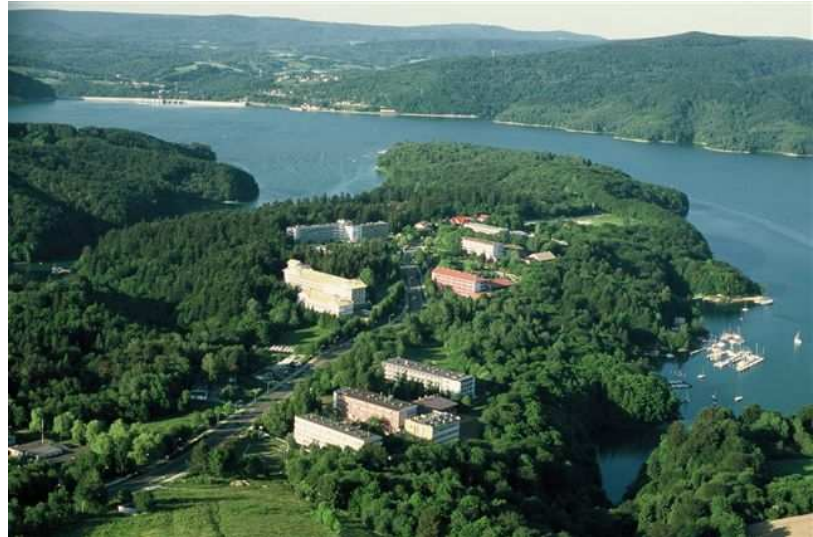
Bird view of Health Resort in Polańczyk