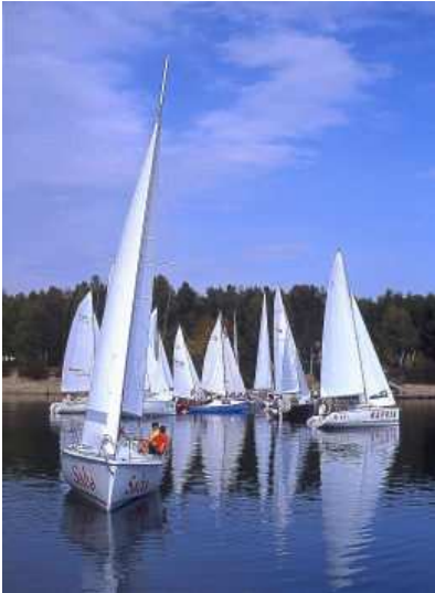
Yachts on Solina Lake